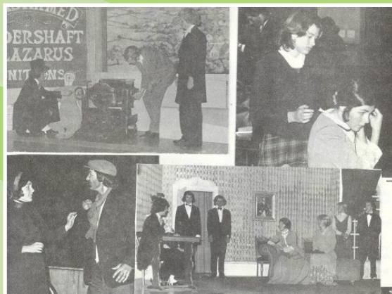
School Production Major Barbara 1976