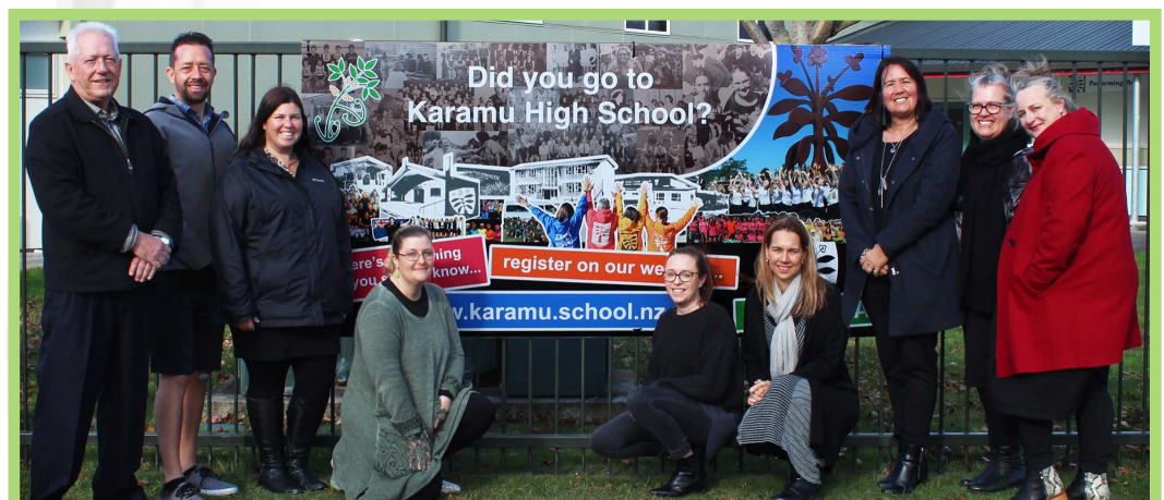
Nine of the thirteen ex-students on staff ready to promote the launch