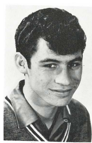
MR. KARAMU, 1965.