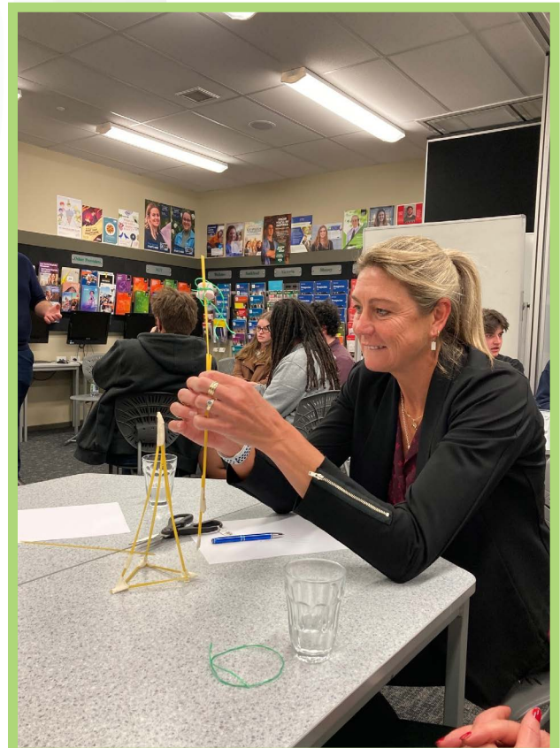
Irene van Dyk