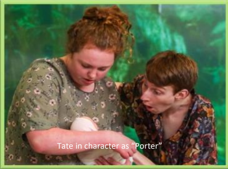
Tate in character as "Porter"